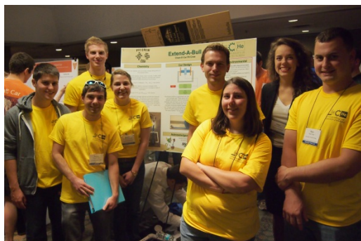
Extend-a-Bull Pit Crew

The USF student chapter won the bid to host the 2015 Southern Regional Conference which is planned to be held at the Sheraton Sand Key in Clearwater.